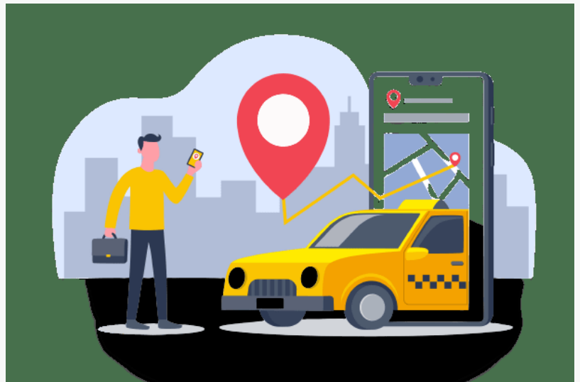
Goa Taxi Service