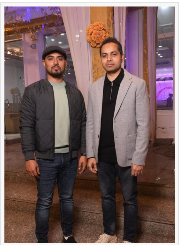
Sourcing Hands has partnered with some of the most prestigious and successful brands in the home furnishings and decor industries and it's through these relationships that the owners foster everyday.

"We are fortunate that through partnership with manufacturers, we are able to make hundreds of thousands of consumers worldwide to experience and enjoy the artistry of India and Southeast Asia. And when you give great service, you foster connections that build more than just products. You build lifelong customers that come back again and again and again,' Sourcing Hands added, 'Our knowledgeable and diligent teams work to connect manufacturers with a network of artisans and factories throughout the United States, Europe, India, South East Asia & the Asian subcontinent, and have become leaders in