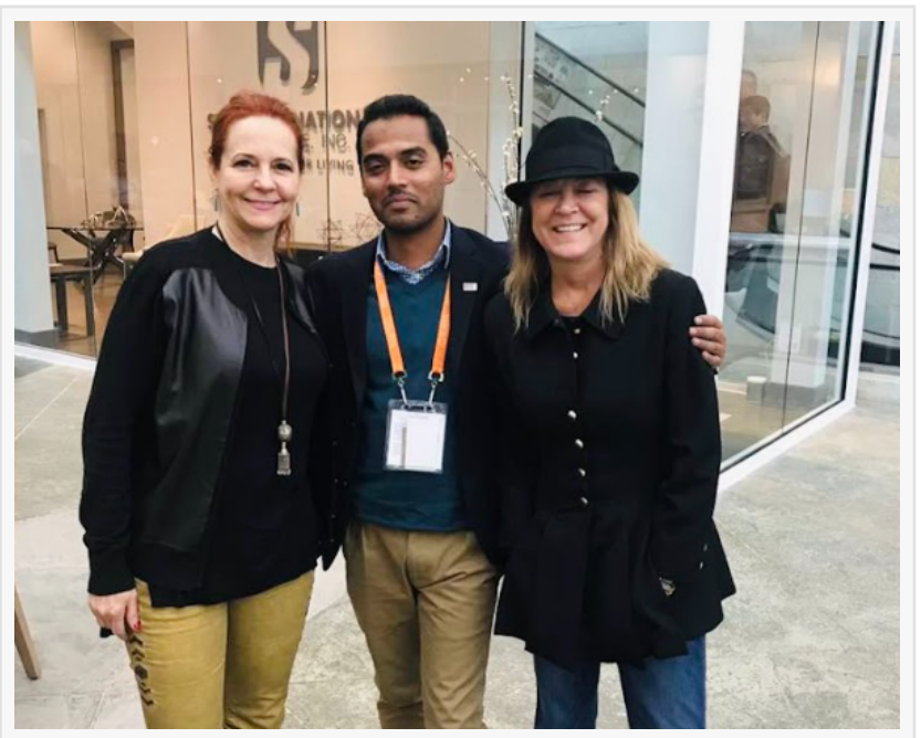
Each market, Sourcing Hands attends with excitement over meeting new people and to continue the valued relationships they have cultivated with manufacturers and distributors throughout the United States.