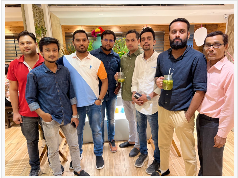
The "Sourcing Hands family" who contribute the company's 20 year legacy and success.

From accent furniture, occasional tables, accessories, lighting, tabletop, and more that are enhanced with an array of materials including marble, stone, various metals, and woods - all with the uniqueness that comes with one of a kind, handmade, and handicraft feel. Ever present in one the most prevalent small towns of Peetal Nagri-known as the "Brass City"; which offers a broad spectrum of metal craft and handicraft designs that embrace