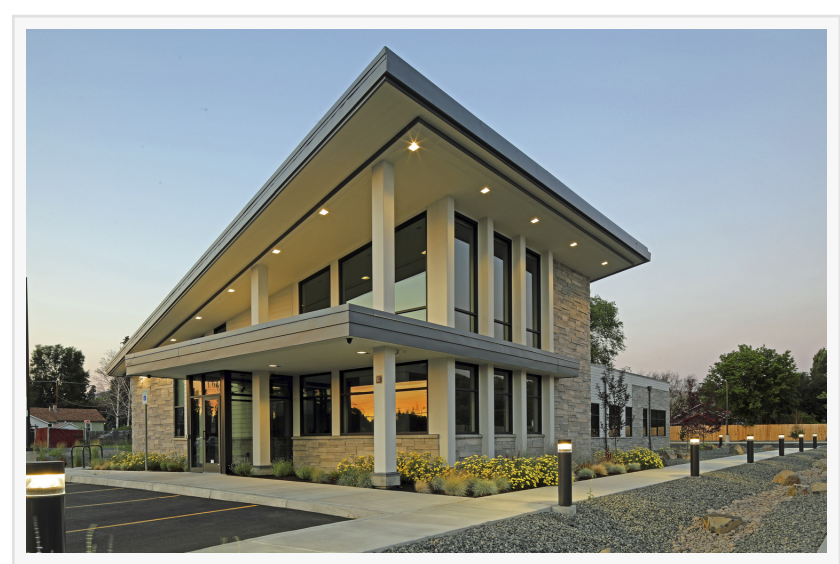
The Exterior of Klamath Smiles Illustrates Signature Elements

MILWAUKEE, WISCONSIN, UNITED STATES OF AMERICA, February 29, 2024 /EINPresswire.com/ -- Milwaukee based Plunkett Raysich Architects, LLP (PRA) recently completed an acquisition of the unique dental design consulting firm Practice Design Group (PDG) of Buda, TX. This merger formally expands the services of the PRA Healthcare Planning and Design Studio to seamlessly support a full Dental Design specialty across the United States.