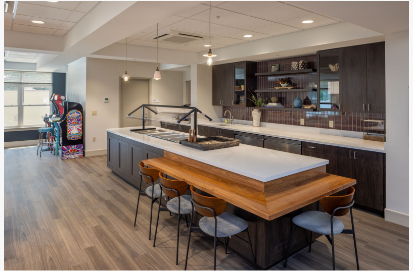
Alpas Wellness Maryland Recovery Center Cafe Area