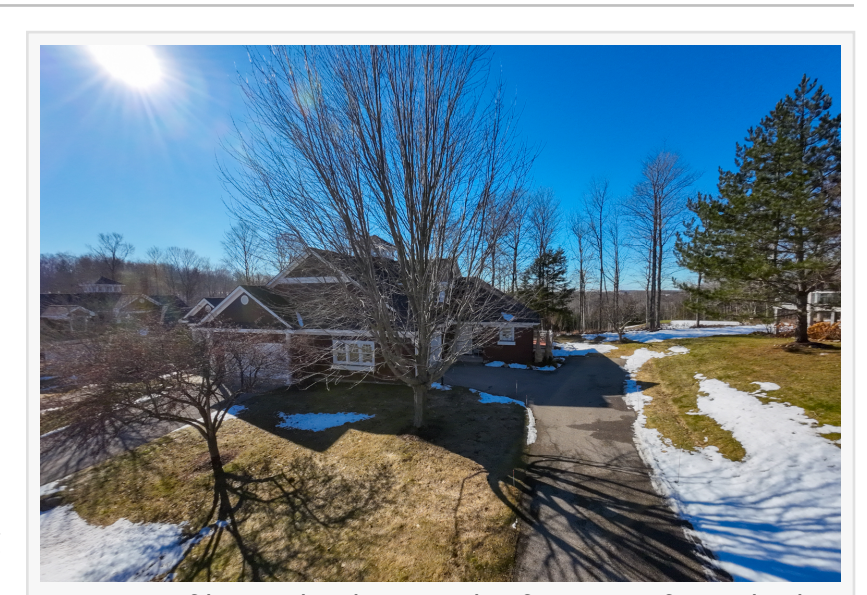
Exterior of home backing to the first tee of Crooked Tree Golf Club

PETOSKEY, MI, UNITED STATES, February 29, 2024 /EINPresswire.com/ -- The newest trend in selling luxury real estate is here, and it's taking the market by storm. Auctions have long been associated with antiques and collectibles, but now they are becoming a popular method for selling high-end properties. The latest property to hit the <u>auction</u> block is 620 Crooked Tree Drive in Petoskey, Michigan, with a starting bid of $489,900.