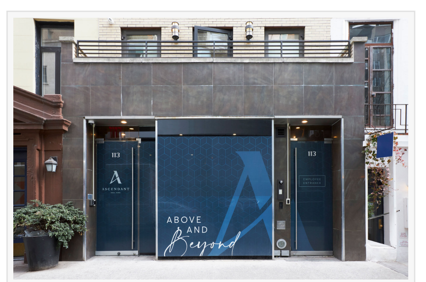
Ascendant Detox - NYC Outside View

Relapse Prevention Therapy: Equipping individuals with practical skills and strategies to identify triggers, manage