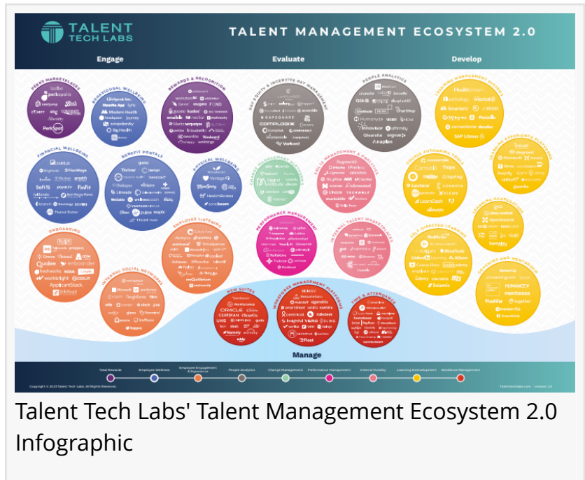
Talent Tech Labs' Talent Management Ecosystem 2.0 Infographic

This new release highlights the most innovative and influential solution providers in the HR industry today.