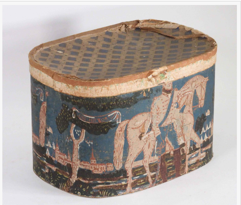
Circa 1850 Andrew Jackson bandbox, covered in a rare "Old Hickory" commemorative War of 1812 pattern featuring president Andrew Jackson walking beside a horse (est. $600-$800).

Lots 40-82, set to hit the auction block at 11 am, are figural creamers from the Mendon Historical Society. This wonderful array of pottery includes examples from Royal Bayreuth, Rookwood and others, ranging from animal creamers to Toby pitchers. The whimsical collection showcases the creativity and design prowess of German porcelain.