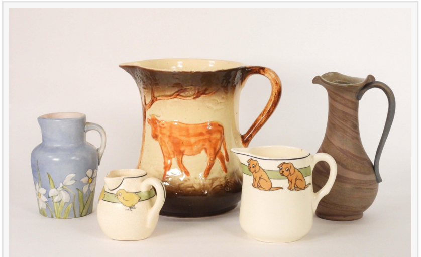
Early 20th century five-piece set of American ceramic pitchers and creamers attributed to Roseville (est. $200-$300).

-- Four important single-owner collections – of museum bandboxes and hatboxes ; figural creamers ; massive original baseball-themed murals ; and police equipment – will all come up for bid on Monday, March 18th, by Bruneau & Co. Auctioneers, online and live in the gallery located at 63 Fourth Avenue in Cranston, starting promptly at 10 am Eastern time.