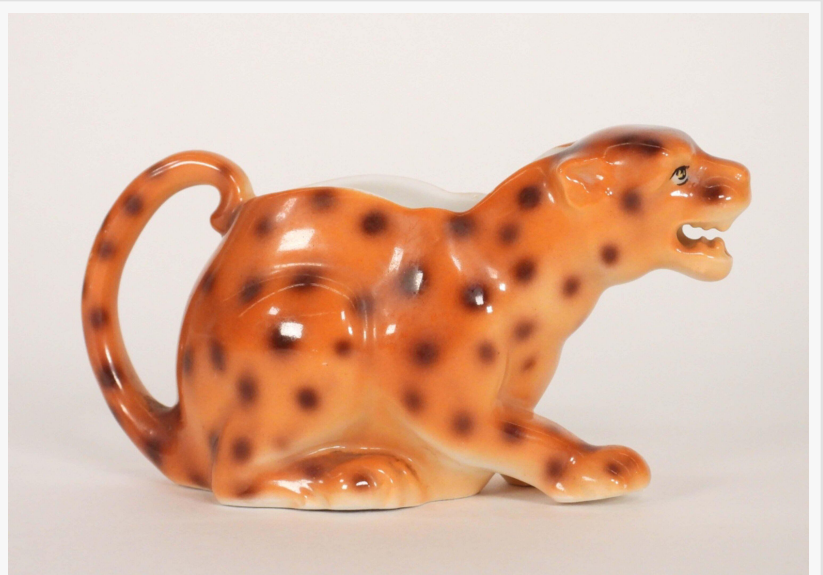
Early 20th century Royal Bayreuth figural creamer depicting a crouching leopard with a curved tail handle and snarling mouth, marked "Royal Bayreuth Bavaria" (est. $600-$800).

Bruneau & Co. Auctioneers is always accepting quality consignments for future auctions, with commissions as low as zero percent. Now would be a perfect time to clean out your attic. To contact Bruneau & Co. Auctioneers about consigning a single piece or an entire collection, you may send an e-mail to info@bruneauandco.com . Or, you can phone them at 401-533-9980.