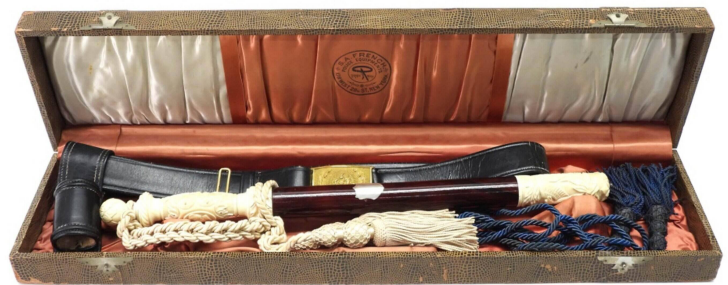
20th century S.A. French presentation police club, consisting of a leather covered wood box opening to reveal a wood club with decorative floral carved handle and top (est. $800-$1,200).