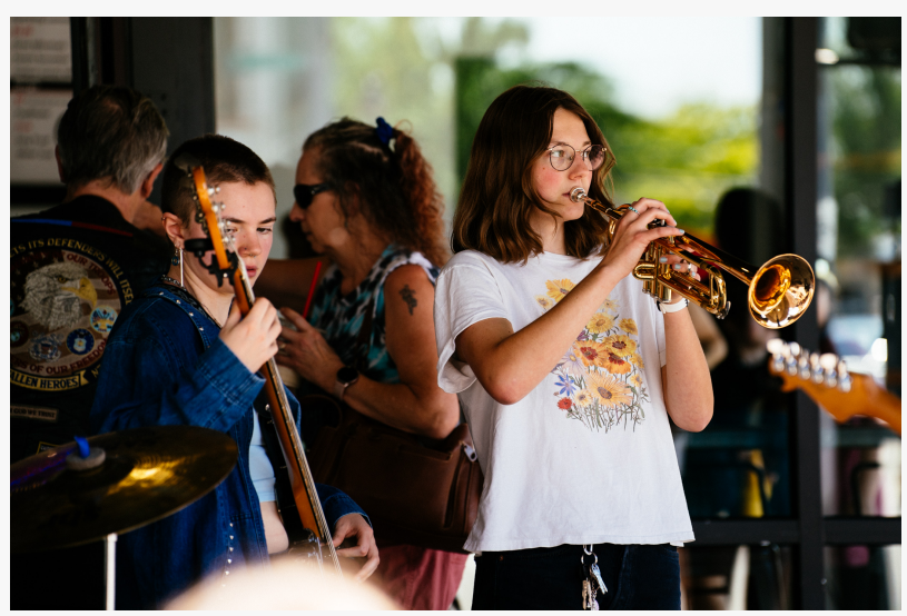
SMF performing at Salem Make Music Day 2023.

This press release can be viewed online at: https://www.einpresswire.com/article/692508771