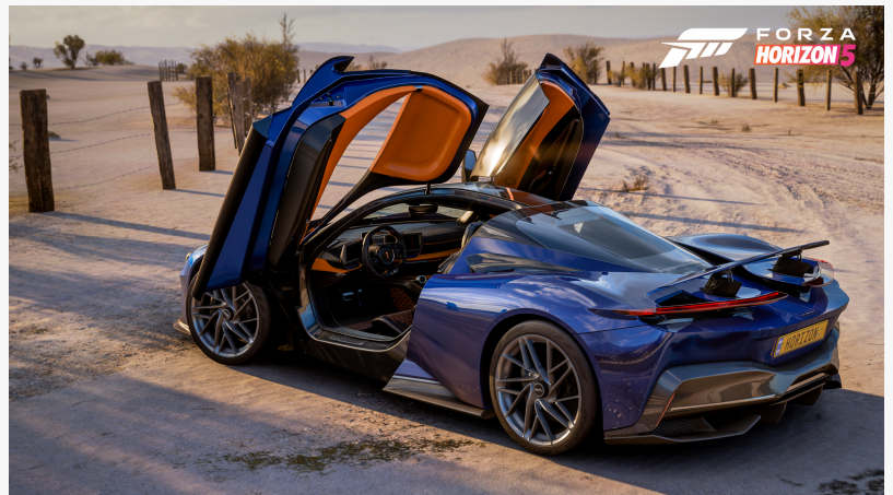
Automobili Pininfarina Battista x Forza Horizon 5_1

Gamers and racing fans can now get behind the wheel of the Automobili Pininfarina Battista electric hyper GT, following its addition to the open world driving action of Xbox Game Studios and Playground Games' award-winning Forza Horizon 5 video game.