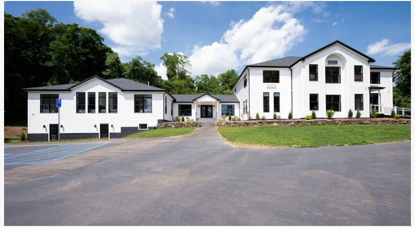
Paramount Wellness Connecticut Recovery Center Substance Abuse Treatment

"For over two decades, Paramount Wellness Connecticut Recovery Center has been a beacon of hope for individuals seeking liberation from addiction," shared a spokesperson for the center. "Our commitment to personalized care and holistic healing remains unwavering as we introduce our specialized focus on family counseling."