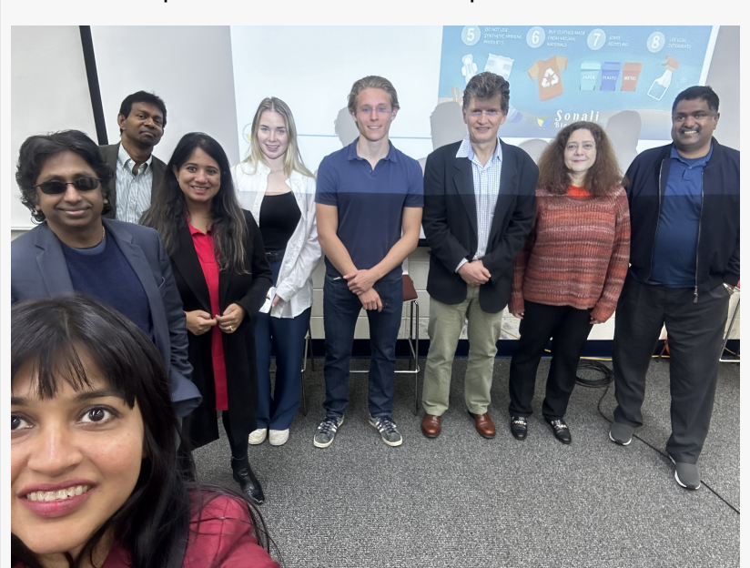
Group pic - Net Zero a reality?