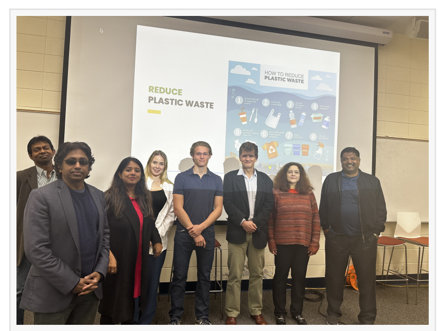
Group picture - Net Zero a reality?

This press release can be viewed online at: https://www.einpresswire.com/article/692724763