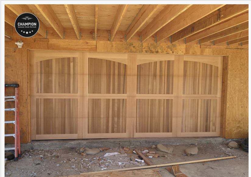
Certified garage door repair Newport Beach

The company's line of services includes general repairs, replacement of broken rollers, hinges, springs, motors, off-track service, track, cable and rail repair, opener repair and replacement, fixing garage doors that fail to open or close, emergency repair, maintenance and safety inspections, sales and