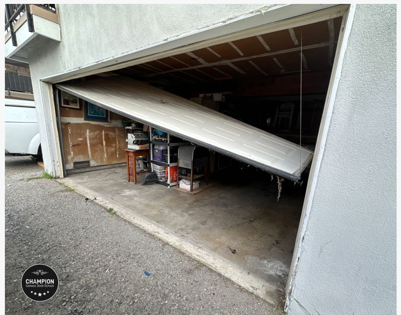
Garage door spring and cable repair Newport Beach