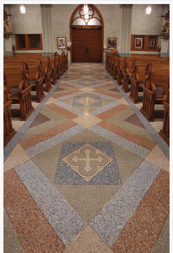
HAND-CRAFTED terrazzo was poured in place in the 1902 sanctuary.

The NTMA is a full-service nonprofit trade association headquartered in Fredericksburg, Texas. Founded in 1923, the NTMA establishes national standards for terrazzo systems for floor and vertical applications. Its mission is to promote quality craftsmanship and creativity in terrazzo while supporting its 152 members in their trade and service to the construction industry.