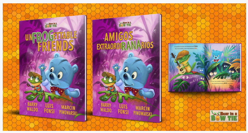
UnFROGettable Friends (Amigos ExtraordiRANArios) now available online wherever books are sold.

"UnFROGettable Friends" is available for purchase today, March 7th, 2024, just in time for the Easter gift-giving season. The book is available in both English and Spanish ("Amigos ExtraordiRANArios"), and it is the inaugural travel installment of the captivating Bear in a Bow Tie series.