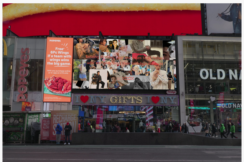
Happy March Birthdays from XOOX

Launched on November 11 last year, XOOX Pet operates as a platform for animals with four legs.