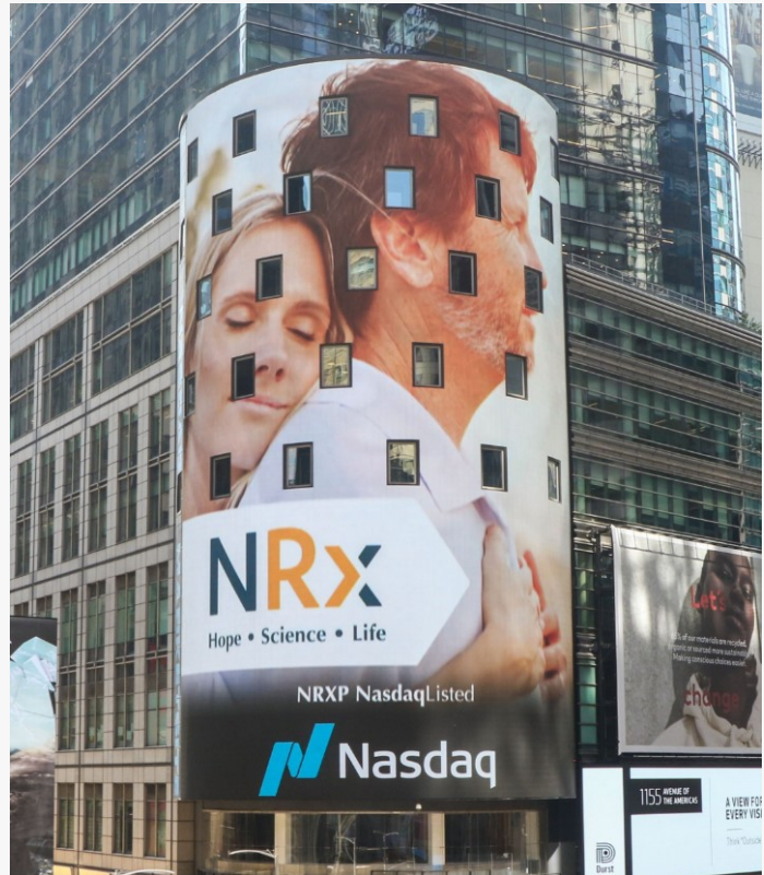
$NRXP on the NASDAQ

Study Maintained 95% Concordance Rate Between Study Sites and Central Raters on Primary Endpoint. No Unexpected Serious Adverse Events