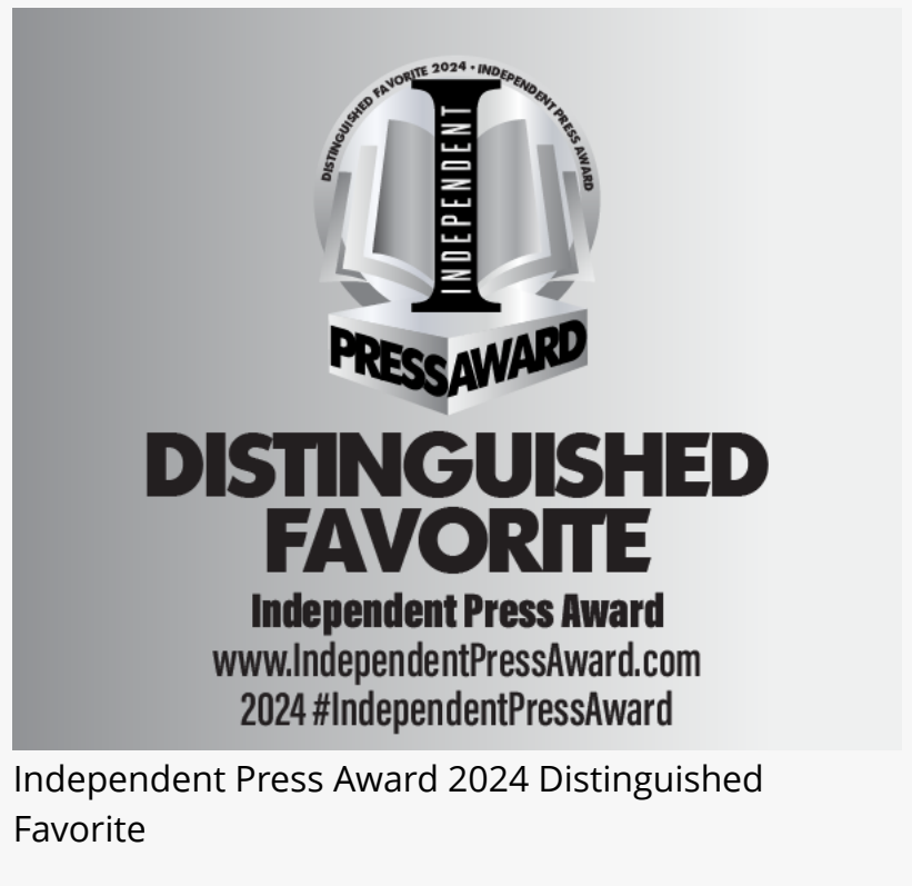
Independent Press Award 2024 Distinguished Favorite