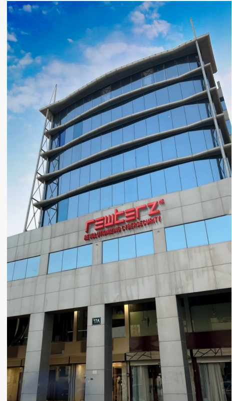
Launch of Rewterz Middle East, Riyadh, Saudi Arabia