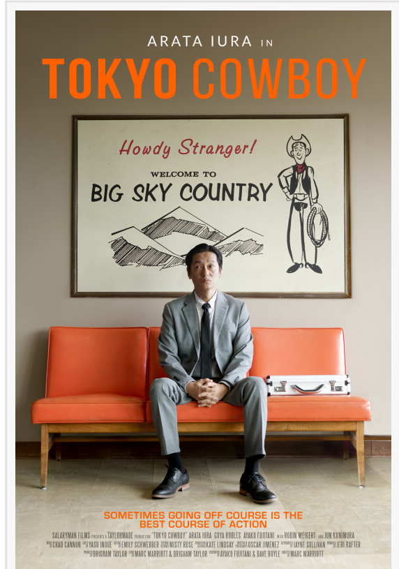
Tokyo Cowboy - Best Feature Drama Award - SIFF