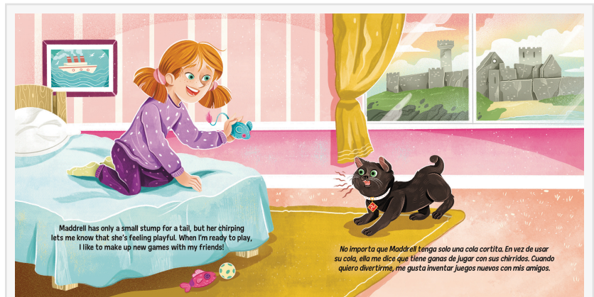
Meet kids and their unique furry friends from all over the world

Beyond the lively illustrations, parents, librarians, and educators will love this book because of how it helps fuel children’s observations of the world around them and can inform their interactions with family members, friends, and peers. How Cats Say I Love You / Cómo los gatos dicen te quiero is a great way to ignite a conversation between a child and their caregiver about understanding and respecting physical and emotional boundaries. Above all, this book gives examples of healthy ways to communicate and respond to social stimuli.