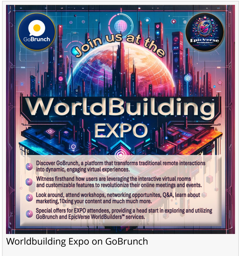
Worldbuilding Expo on GoBrunch

WHEN: Tuesday, March 5th at 8am PST and Wednesday, March 6th at 2pm PST