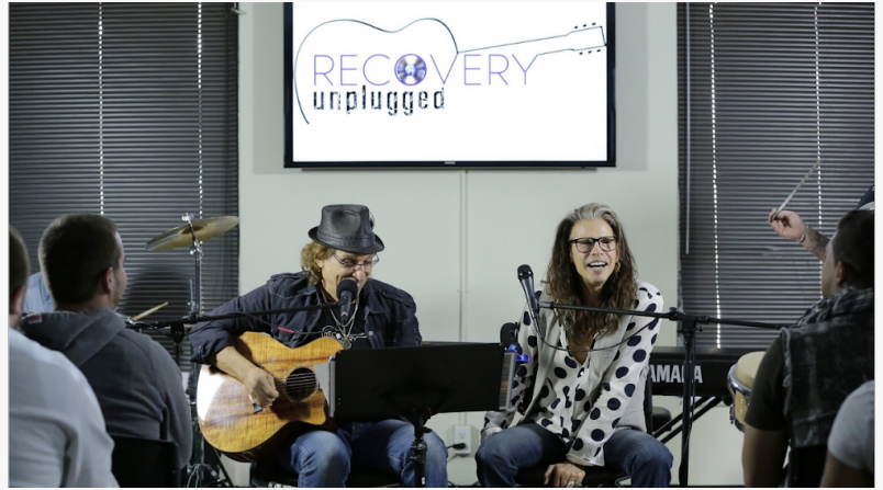
Recovery Unplugged Drug Rehab - Steven Tyler performance