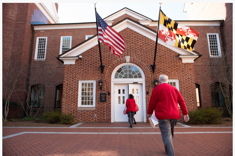
Advocacy volunteers convene in Annapolis during the legislative session.

ANNAPOLIS, MD, USA, March 5, 2024 /EINPresswire.com/ -- A red tide of AARP Maryland members will converge on Annapolis this Thursday, March 7, for the organization's annual lobby day to connect with lawmakers and raise awareness of issues of importance to Marylanders aged 50 and over , including prescription drug affordability, support for family caregivers, long-term care oversight, consumer protections, affordable gas and electric and retiree tax relief.