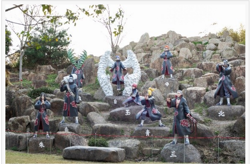
Find statues of popular characters

This press release can be viewed online at: https://www.einpresswire.com/article/693410093