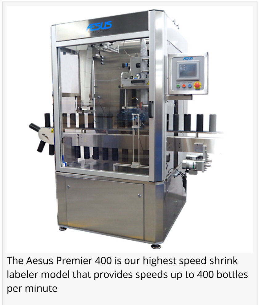
The Aesus Premier 400 is our highest speed shrink labeler model that provides speeds up to 400 bottles per minute

Pack Expo East 2024, booth 501, for a firsthand look at the future of packaging technology with Aesus.