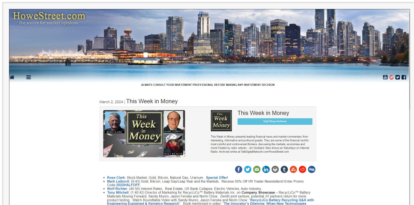
VANCOUVER SKYLINE AS A BACKDROP TO THE HOWE STREET RADIO SHOW