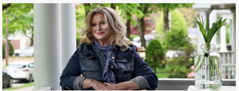
Author, Nancy Earley Wright

bear to illustrate the highs and lows of bipolar disorder. The narrative not only educates young readers about mental health but also provides a platform for open conversations between parents and children.