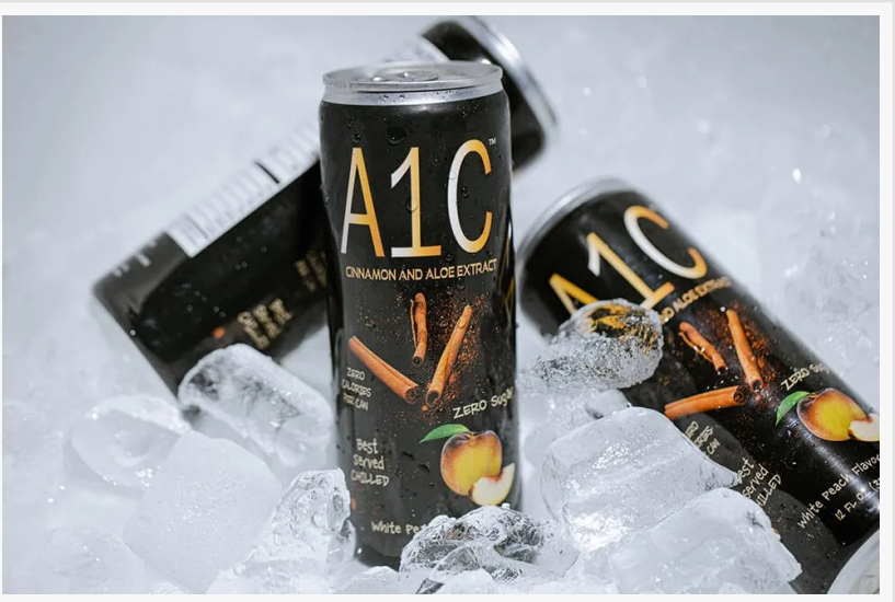
A1C - The Best Tasting, Healthy Beverage for Adults and Children

Make the switch to A1C Drinks today and experience the difference for yourself. Visit your nearest Rouses Market to discover the refreshing taste and health benefits of A1C Drinks.