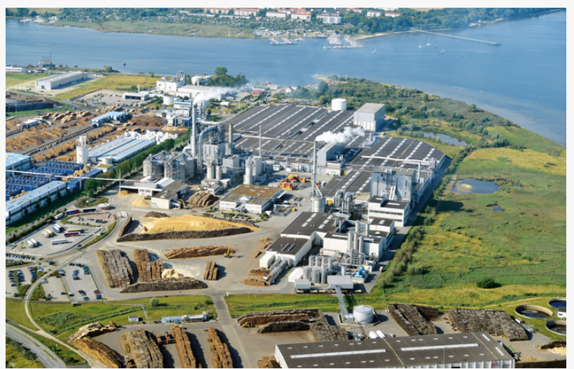
Egger's laminate flooring factory

- Egger Aqua wooden floor line (1,000-hour submerged warranty) has a swelling level of \leq 5\% ( \pm 1 ).