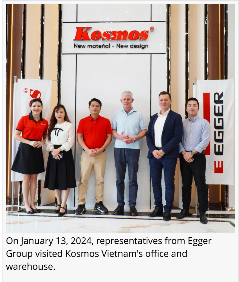
On January 13, 2024, representatives from Egger Group visited Kosmos Vietnam's office and warehouse.

Egger laminate flooring is produced on a modern technological line, does not contain PVC, and has extremely low formaldehyde content <0.1ppm according to the EN 717-1 testing method, meeting E1 and CARB2 standards. Besides, the floor also has surface antibacterial properties,