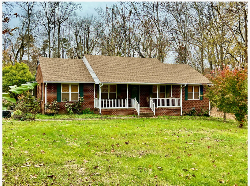
4155 Broad St. Rd., Gum Spring, VA 23065