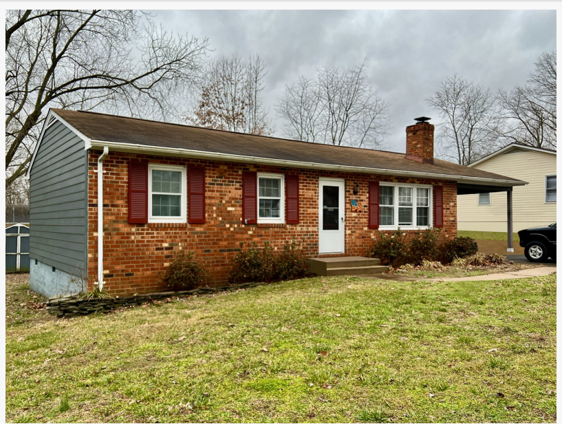
5516 Rudy Ln., Fredericksburg, VA 22407