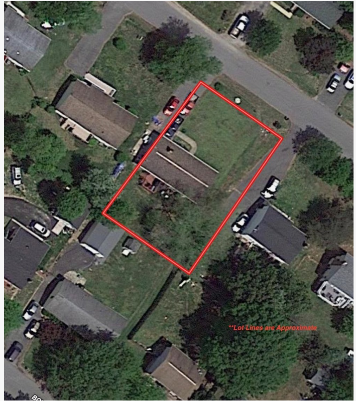
5516 Rudy Ln., Fredericksburg, VA 22407

The real estate auction is open to the public. Brokers are reminded that pre-registration is required for compensation.