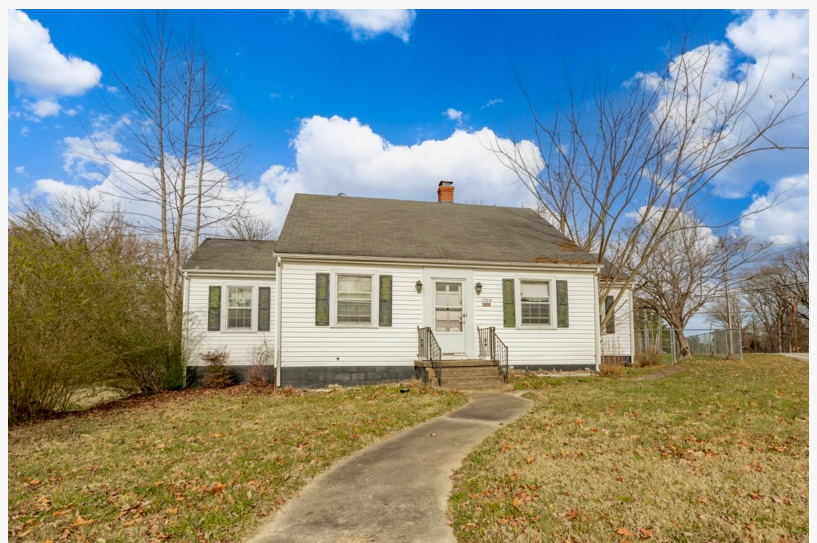
1720 13th St., Victoria, VA 23974