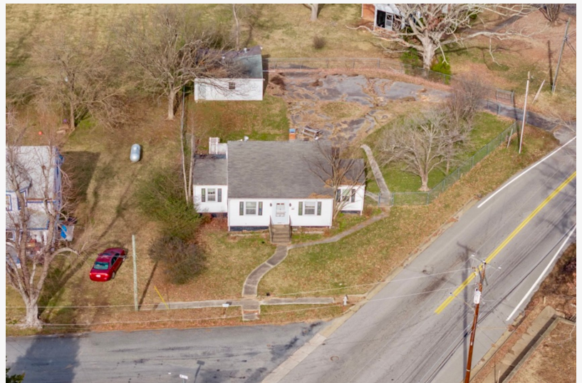
1720 13th St., Victoria, VA 23974