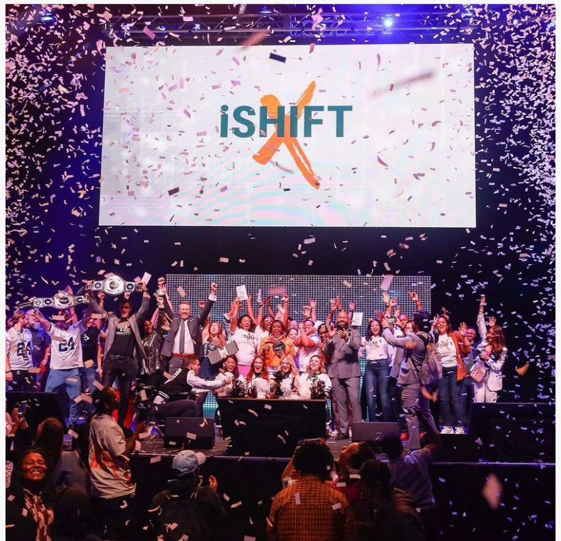
Judges Choice Winners: iShift