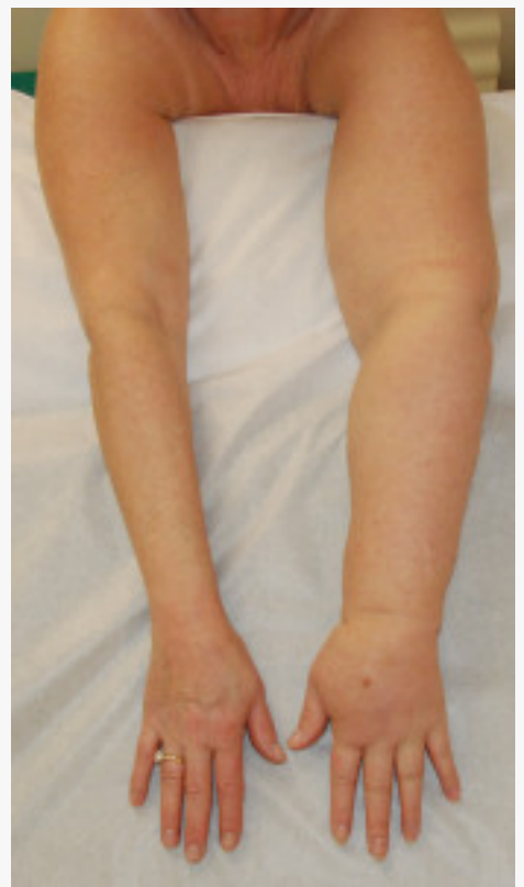
Lymphedema of the arm

The use of certain pharmaceuticals (diuretics, antimicrobials, antibiotics) for Lymphedema, as well as Lymphedema risk-reduction practices and nutritional aspects (proteins, fluids, salt, vitamins, and supplements), is described and explained. Finally, helpful guidelines for traveling with Lymphedema and how to effectively measure and care for compression garments are also included.