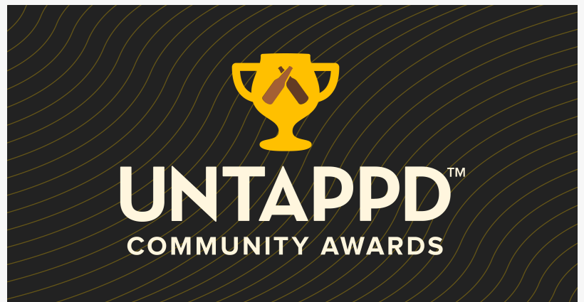
The Untappd Community Awards

beer substyles. The Untappd Community Awards for 2023, presented by Ollie brewery management software, recognized 25,302 beers brewed by nearly 7,500 breweries globally. Ratings by the Untappd app's global community of nearly 11 million beer enthusiasts powered