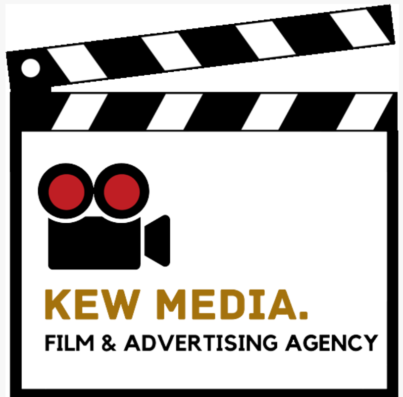
Kew Media Advertising LLC