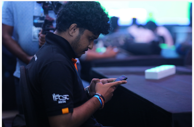
With over 15 years of experience in the Esports industry, InGame Esports has leveraged its knowledge to create a mobile cricket game that stands out from the competition.