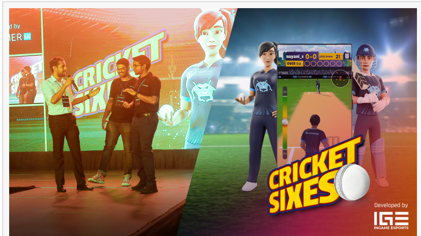
InGame Esports Launches Cricket Sixes - A New Mobile Cricket Experience Geared For Esports

Cricket Sixes boasts a unique gameplay structure, offering a thrilling two-over challenge where players must bat and bowl within a limited timeframe, providing an intense and dynamic gameplay experience. With intuitive swipe, touch, and tap controls, the game ensures a