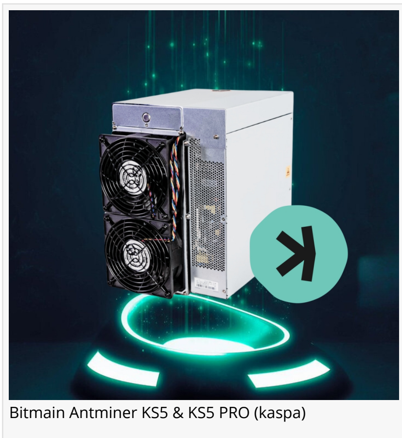
Bitmain Antminer KS5 & KS5 PRO (kasper)

This press release can be viewed online at: https://www.einpresswire.com/article/694117546