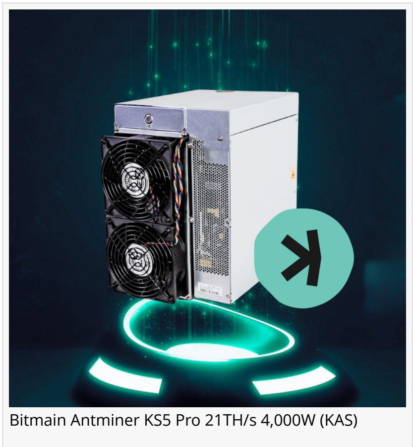
Bitmain Antminer KS5 Pro 21TH/s 4,000W (KAS)

This press release can be viewed online at: https://www.einpresswire.com/article/694120080