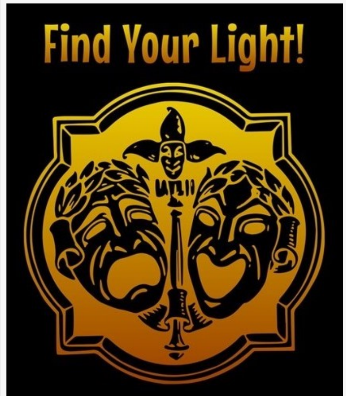
Find Your Light!