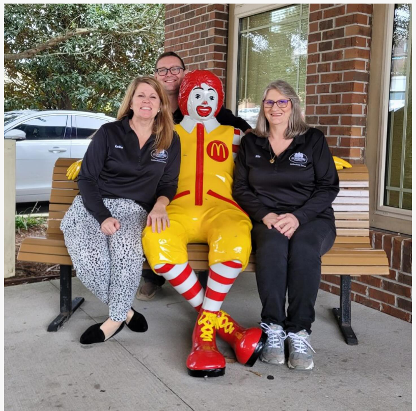
Pensacola Mortgage Loans