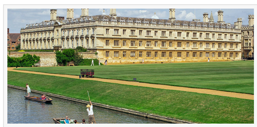
Iconic image of Cambridge

CAMBRIDGE, CAMBRIDGESHIRE, UNITED KINGDOM, March 7, 2024 /EINPresswire.com/ -- As the need for reliable and compassionate home care services continues to grow, Caremark Cambridge & South Cambridgeshire stands out as a beacon of excellence in