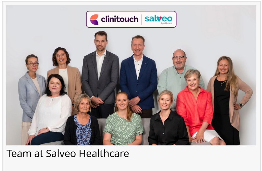
Team at Salveo Healthcare

TASMANIA, AUSTRALIA, March 7, 2024 /EINPresswire.com/ -- The pilot, which launched at the beginning of February, aims to keep Tasmanians out of hospital and managing their healthcare from home. Patients are already seeing the benefits of the new service, with over 100 patients expected to be onboarded to the program by the end of the month.