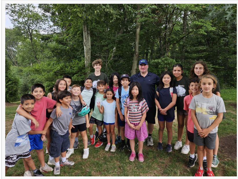
Race 4 Chase at the Westport Weston Family YMCA 4.

About Westport Weston Family YMCA The Westport Weston Family YMCA is a cause-driven organization that strives to be a welcoming and supportive environment for all. Our purpose is to strengthen the foundations of the community through our actions and programs. We believe that to bring about meaningful change in individuals and communities, we must be focused and accountable. At the YMCA, we measure the success of our cause by how well we engage communities in our three areas of focus: Youth Development, Healthy Living, and Social Responsibility.