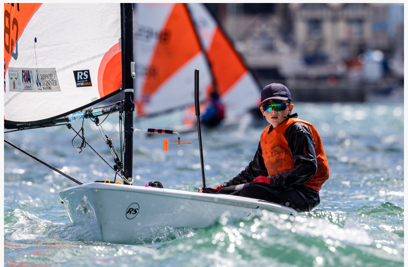
RS TERA SPORT JUNIOR SAILING