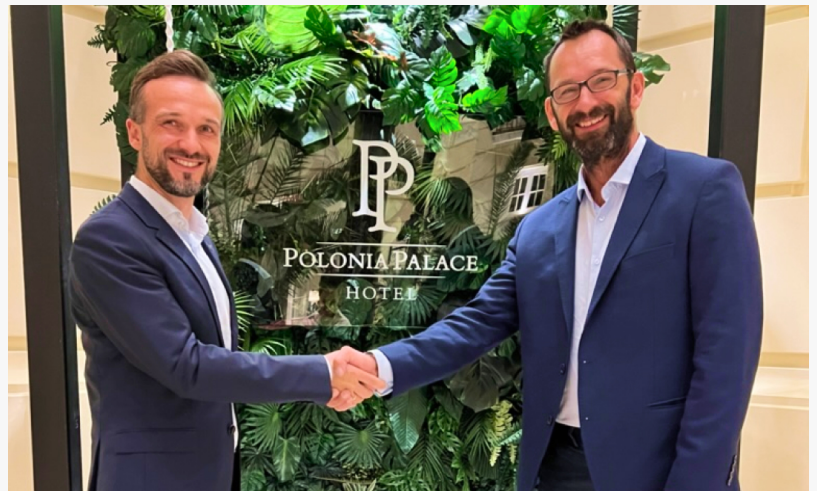
Kogifi & Aidar Partnership Signature in Polonia Palace

AIDAR Solutions specializes in VR (Virtual Reality) and AR (Augmented Reality) technologies, offering immersive solutions to enhance business performance. Their products include AIDAR.SKILLS for virtual trainings and AIDAR.SERVICE for AR-assisted remote support. AIDAR aims to revolutionise training and support processes, reducing material waste, training time, expert trips, and service time significantly