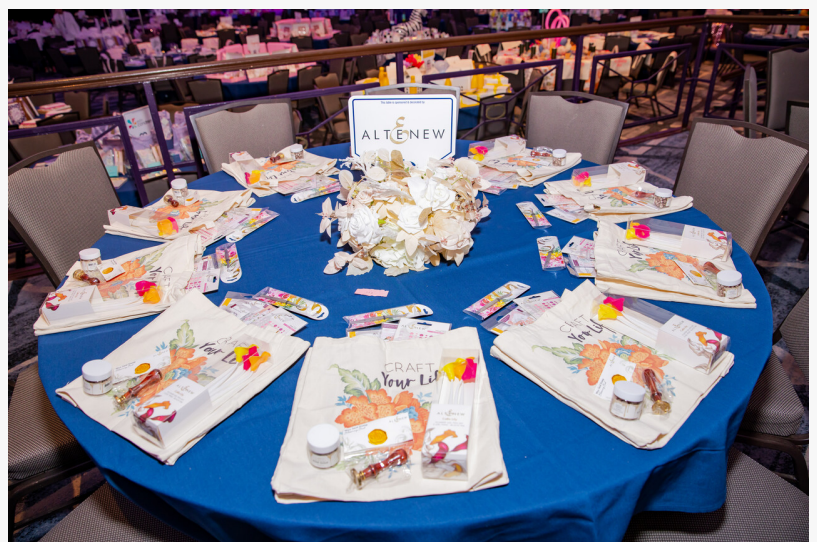
Altenew provided swag bags with bestselling crafting supplies at Go Wild 2023.