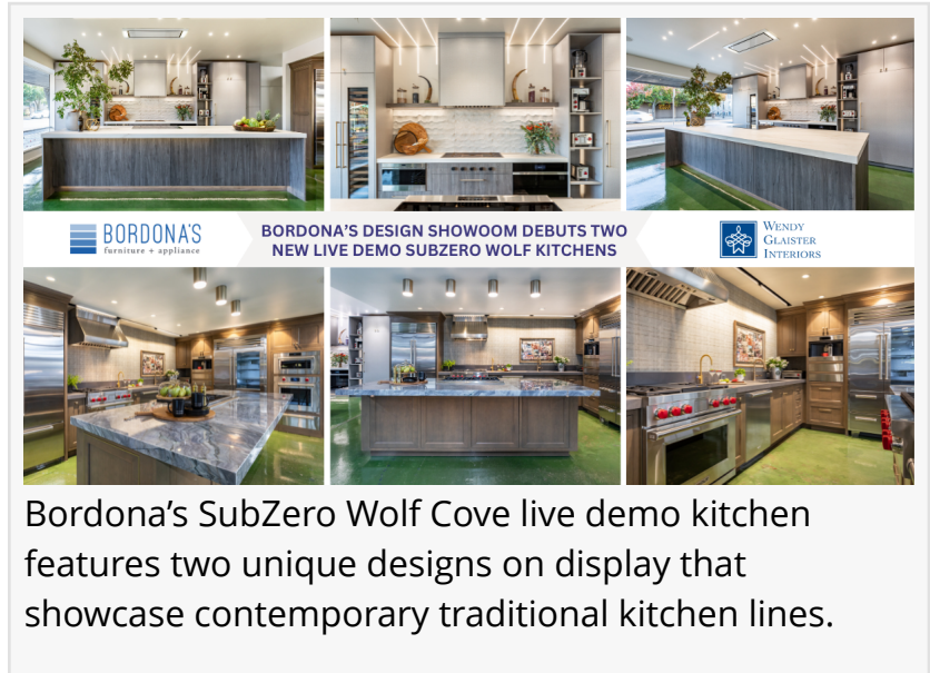
Bordona's SubZero Wolf Cove live demo kitchen features two unique designs on display that showcase contemporary traditional kitchen lines.