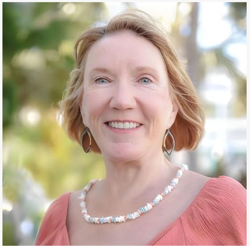
Author Barbara Lane

This press release can be viewed online at: https://www.einpresswire.com/article/694429876